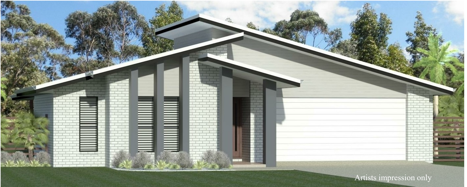
Artists impression only